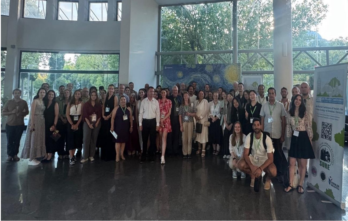
Photo 1: From the Opening Reception of the 4th SURE World Conference

On the evening of the first day, the opening reception was held with a large turnout. Scientists from various countries gathered in a friendly and dynamic setting where they exchanged ideas not only socially but also scientifically. The event provided a valuable opportunity for networking, and many participants engaged in discussions about potential future collaborations, brainstorming project ideas shaped by interdisciplinary approaches (Photo 1).