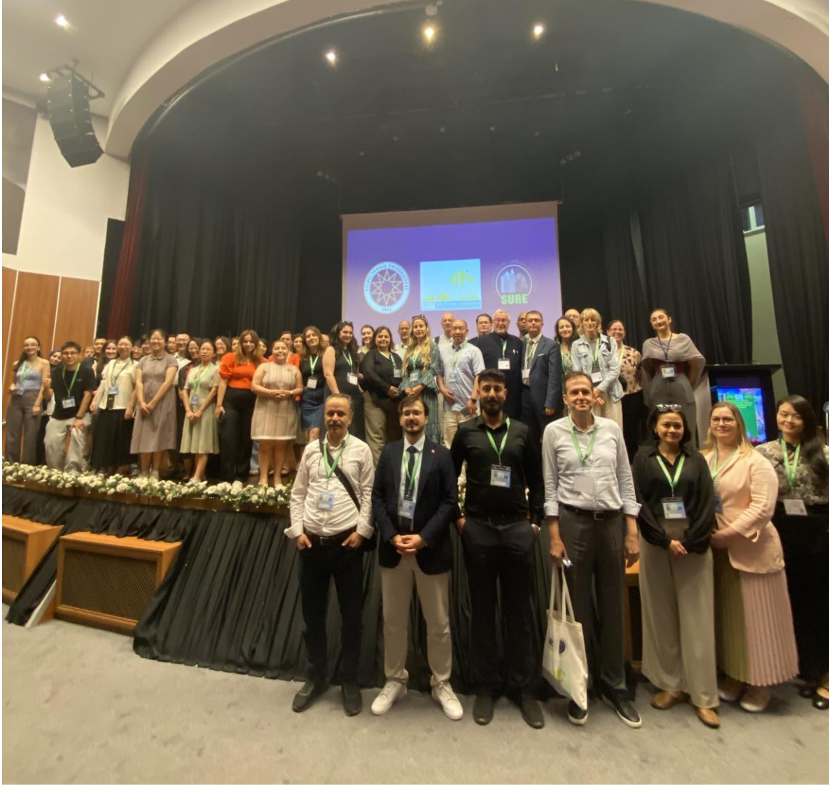
Photo 2: Participants of the SURE General Assembly